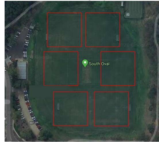
South Oval – 6 groups of 20