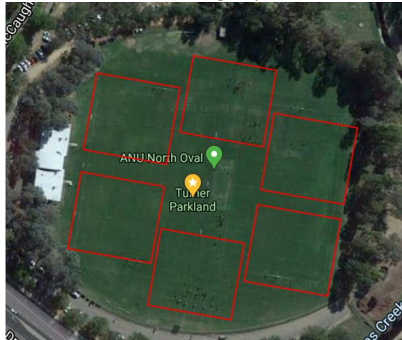
North Oval – 6 groups of 20